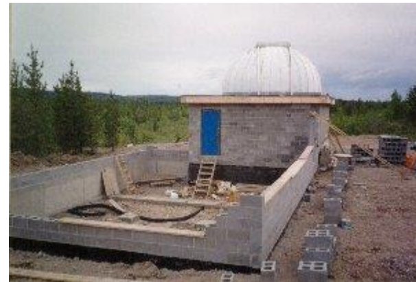
Above: Construction of the Classroom on May 1993

Since the opening of the PGAO, a grant from the former Ministry of Advanced Education, Training and Technology has enabled the society to promote science education within the Prince George community through school visits, public viewing sessions and participation in special events such as Science and Technology Week and the Central Interior Science Exhibition. The PG Centre now provides regular observatory access to the general public and special interest groups such as Cubs, Brownies and schools. We invite you to help with our continuing efforts and growth.