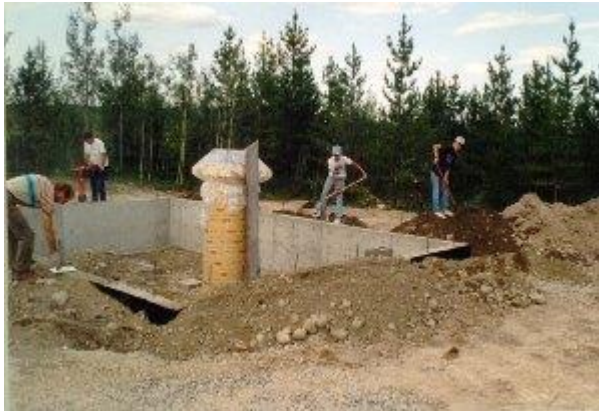
Above: Construction of the new Observatory on July 1992

In the summer of 1992, construction of a new observatory near West Lake began . During the spring of 1993, the PGAS received funds from the Science Council of British Columbia to help with the completion of the Observatory. On August 6, 1993 the Prince George Astronomical Observatory (PGAO) was opened to the public