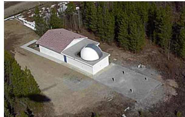
Above is a photo of the new Prince George Astronomical Observatory on April 2004

Since the opening of the PGAO, a grant from the former Ministry of Advanced Education, Training and Technology has enabled the society to promote science education within the Prince George community through school visits, public viewing sessions and participation in special events such as Science and Technology Week and the Central Interior Science Exhibition. The PG Centre now provides regular observatory access to the general public and special interest groups such as Cubs, Brownies and schools. We invite you to help with our continuing efforts and growth.