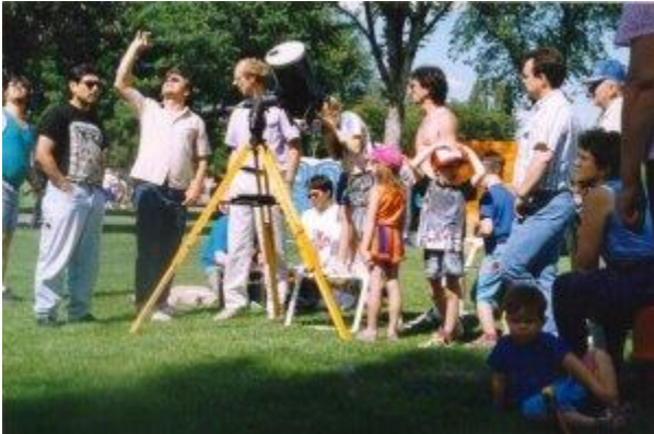
Above: Solar viewing at Fort George Park with the Celestron and H-Alpha Filter on Canada Day 1993

The interests of our members define the club's astronomical activities. They include such things as: Evening Observing, Astronomy Workshops, CCD Astrophotography, 35mm Astrophotography, Observatory Tours, Solar Viewing, Supernovae Search, Public Presentations, Astronomy Education, Near Earth Asteroid Observations, Astronomy Videos, Slide Shows, Image Processing, Messier Object and Lunar Viewing Marathons, Variable Star Photometry, Meteor Detection Using Cameras, Fund Raising, and Maintaining the Observatory.